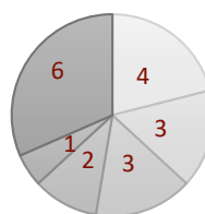
Minimum Graduation Requirements 20 credits

Brilliantmont International School offers a traditional college preparatory curriculum leading to a High School Diploma. To graduate a student must complete at least 20 academic credit courses and have proficiency in at least one foreign language . A sufficient number of electives must be followed in order to obtain at least 20 credits in all. In addition to the 20 academic credits, a minimum IBT score of 79 or an IELTS score of 6.5 is required of all foreign students who wish to receive a graduation diploma. The students whose IBT (or equivalent) score lies between 60 and 78 (IELTS 6.0) will receive a graduation certificate.